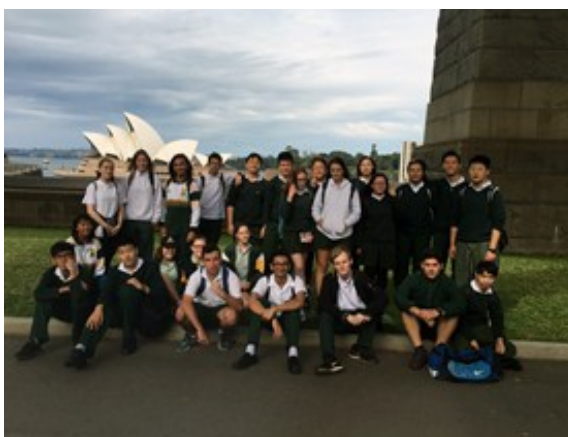
IEC students from CS2X on excursion