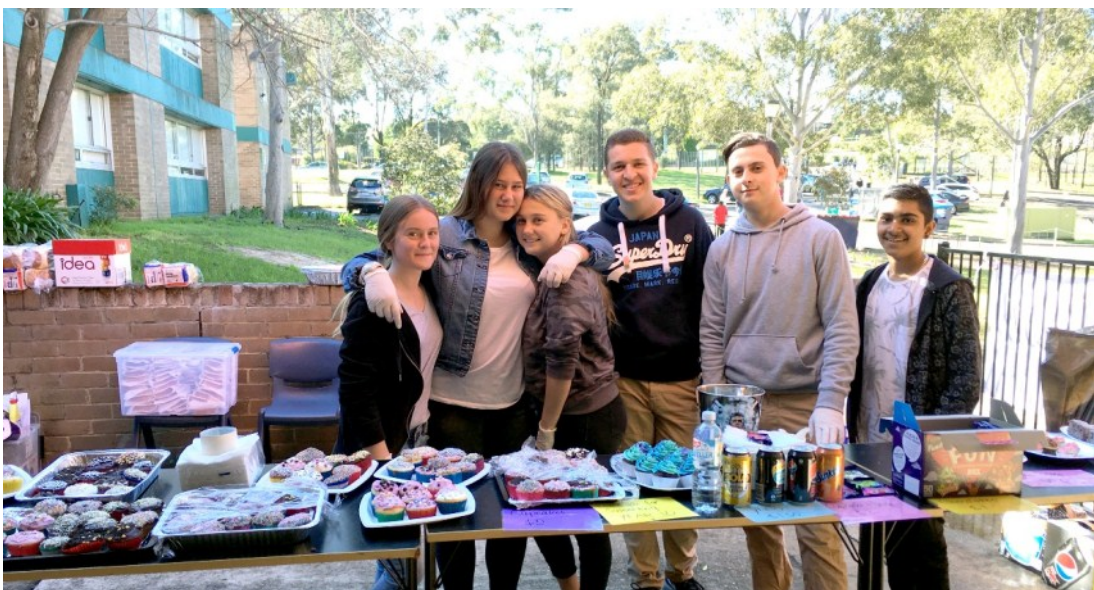
Students help run the cake stall at the recent local council election