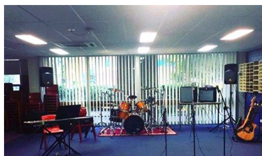
Year 12 Music HSC Practical Examination