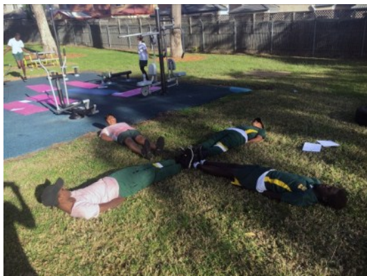
Evans students training hard