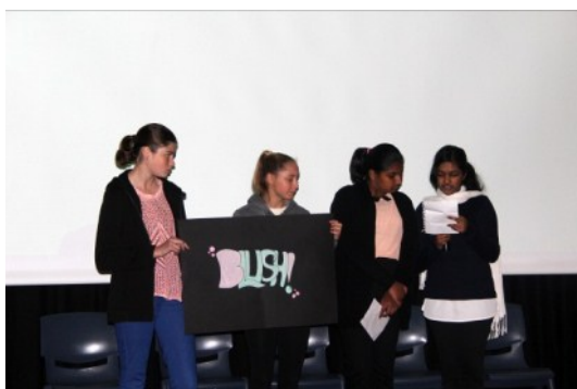
Year 8 students at Real Game