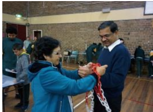
Maths Fun Day