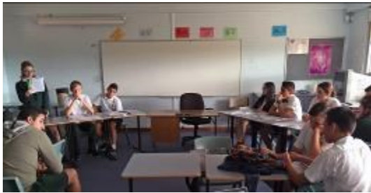
Year 11 debating teams in Modern and Ancient History