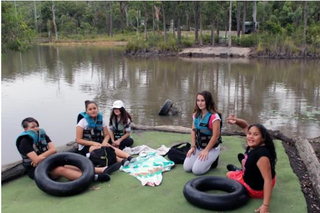
Year 7 students on the Great Aussie Bush Camp

Term 2 has been an exciting and busy term for our Year 7 students. In Week 2 students headed to the Great Aussie Bush Camp for the highly anticipated Year 7 Camp.