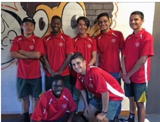
Student leaders in Creating Chances