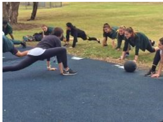
Evans X Train working out on the outdoor gym