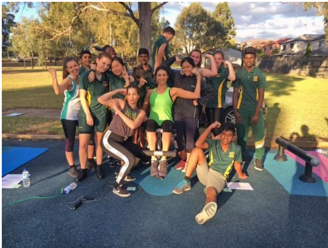
Evans students in training

Evans X Train is a program run by Ms Lolas that allows students between ages 14-18 from the high school and Intensive English Centre to access a structured fitness class.