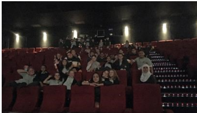
Evans students at the movies