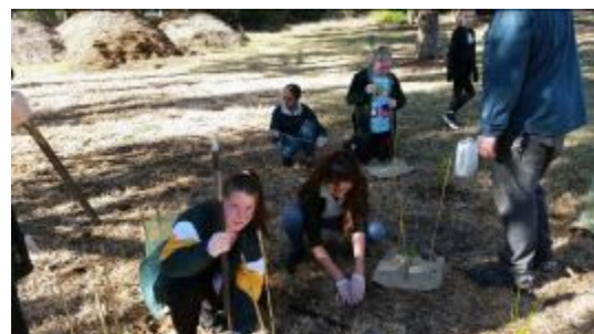
IEC and Evans' students planting natives for Greening Australia Day