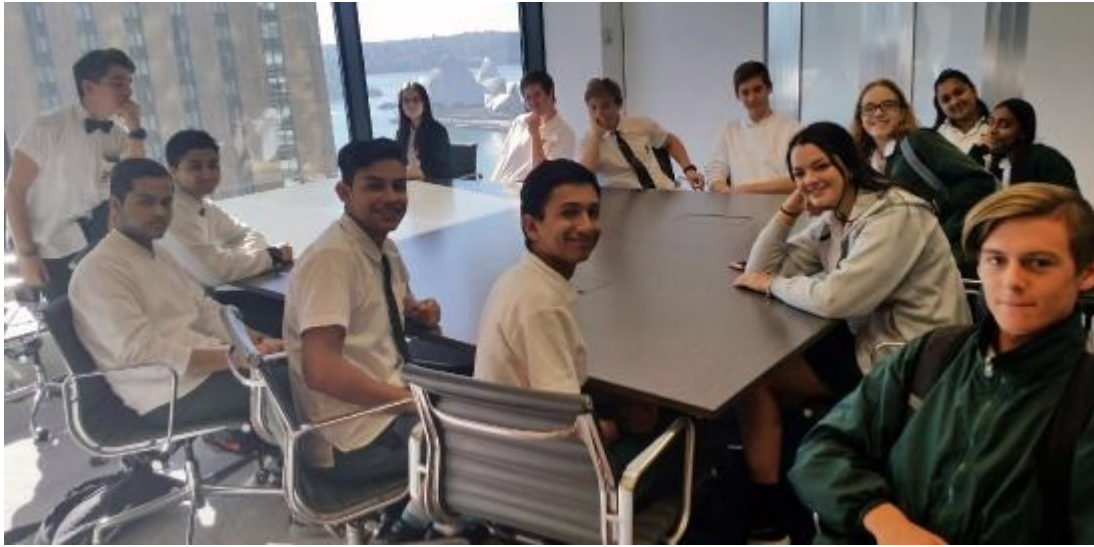
Year 11 students in Sydney with ABCN Aspirations