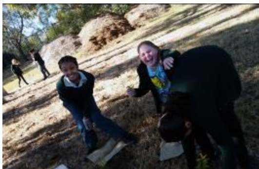
Year 8 students greening Evans