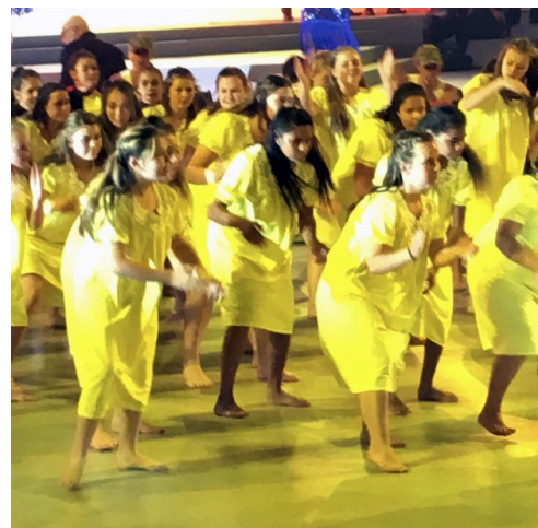
Evans students perform at Schools Spectacular 2015

On behalf of the entire CAPA staff, I would like to wish you and your family a safe, happy and spiritual holiday break as we together prepare and look forward to an even better 2016.