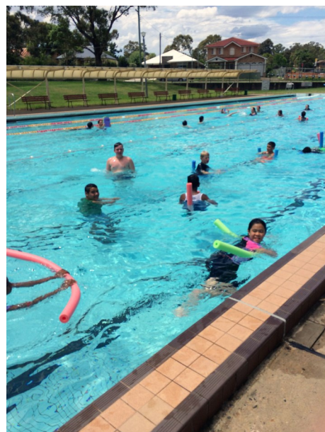
Year 7 students at Swim School