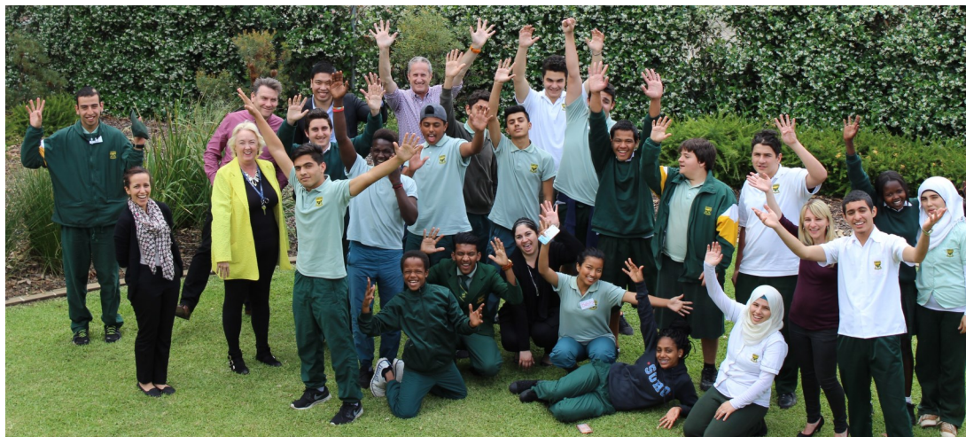
IEC students participating in the ABCN Interact workshops

Interact is a series of workshops designed for recently arrived, high school-aged migrants and refugees whose first language is not English.