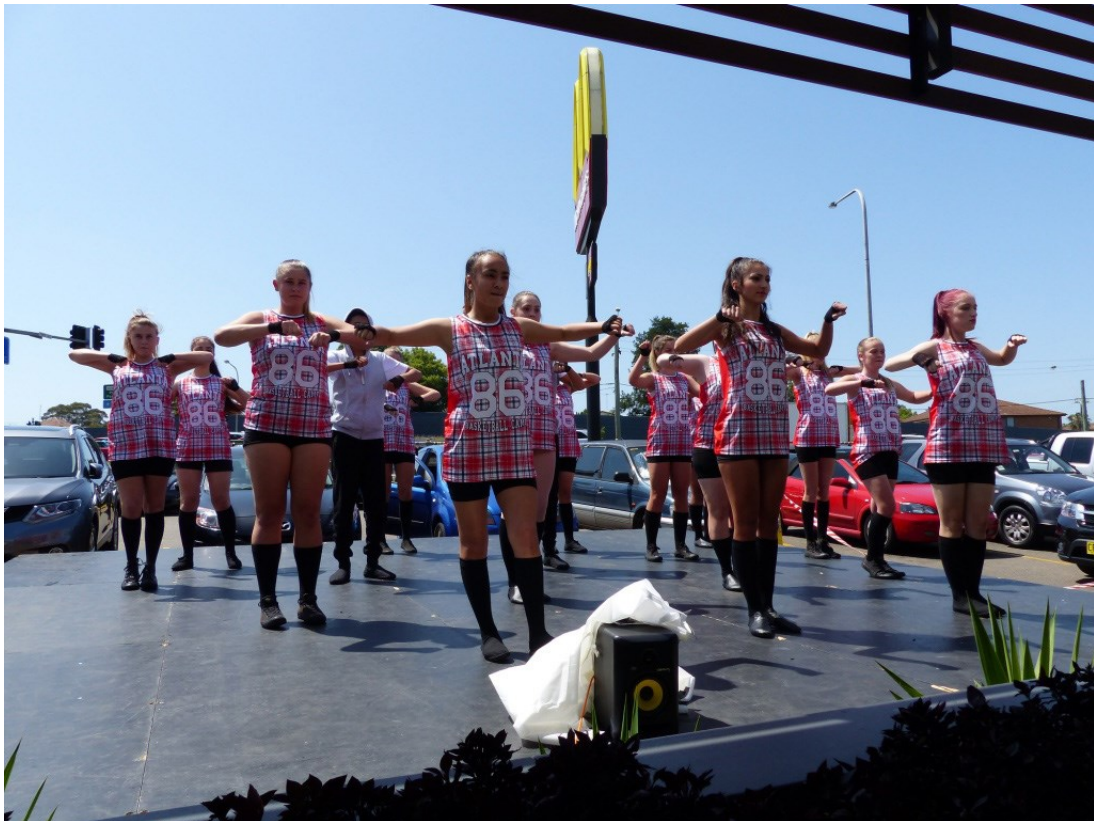
Evans Dance Ensemble performing at McHappy Day